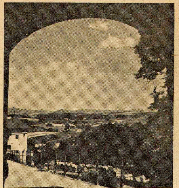
This is how the new Division Rest Center at the Oberhaus in Passau will look to the first contingent of GIs arriving on or about the Fourth (left), and this is how the world will look from the old castle drawbridge once they're in. (right)